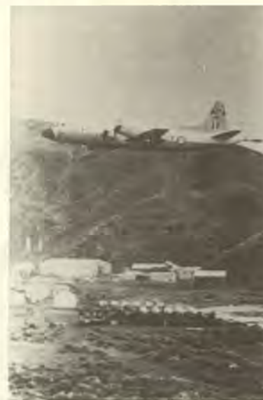
Orion overflies the scientific station at Macquarie Island, 7 September 1977.

Wilkes site. With seven navigators and eight members of the media, the aircraft flew within 70 nautical miles of the base on a round trip of 4,200 miles. (112) A flight to Macquarie Island was made by the same squadron on 21 March 1970, when Flight Lieutenant L. Fisher and his crew dropped mail to expedition members. The 2,900 mile round trip took nine hours to complete, and the storepedo was dropped from an altitude of 300 feet to the waving inhabitants of the island.