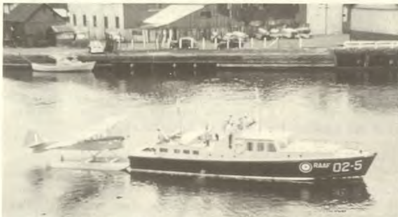
Auster A11-201 is towed from Point Cook to be embarked on Kista Dan.