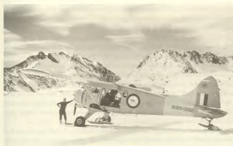
A95-202 poses against a backdrop of nunataks. Note the ski undercarriage, wide access doors and cameras mounted aft of access door.

operations during the summer months was not practical, almost brought tragedy in the years ahead.