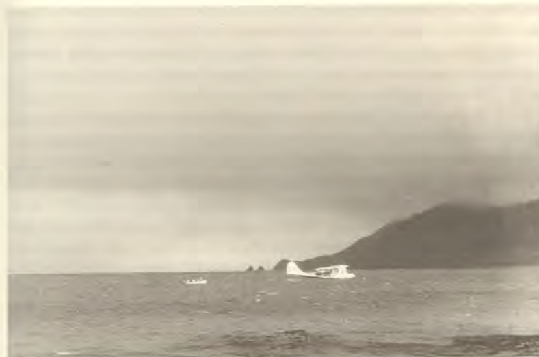
Heard Island as seen by the returning 1959-60 Antarctic Flight