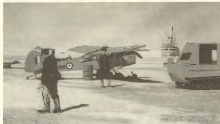
A11-200 on the ice during the approach to Mawson, January 1955. Note the Weazel to the right of the aircraft.