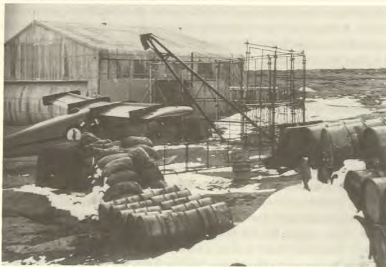
The hangar at Mawson. Note the upright 'boxing' kangaroo on the Beaver.

With the advent of summer, a large 12 inch deep pool of water formed immediately in front of the hangar doors at Mawson. This was the only avenue for the aircraft to be moved from the hangar to the sea ice, and it was possible that these may have broken through the ice. To protect them, and allow for recovery if necessary, the aircraft were winched across the affected area. This hampered support of the Prince Charles Mountain party, which was recovered and returned to Mawson.