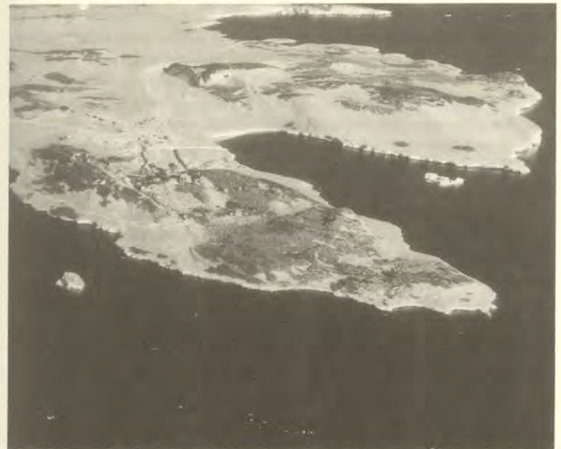
Wilkes Base from the air. This base was taken over by Australia in February 1959 and is now known as Casey.