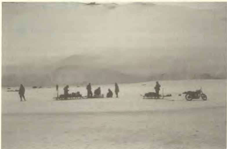
The recovery party. A65-81 can just be seen centre top of photograph. (Graham Dyke)

During the scheduled radio link with Mawson on the following morning the news was passed to the relief party that the authorities in Melbourne had vetoed Russian assistance, except for life-saving reasons. At 1pm the party was again crawling at 4mph through the crevasses, heading south. At 8pm 'Bech' tents were erected, and the party slept.