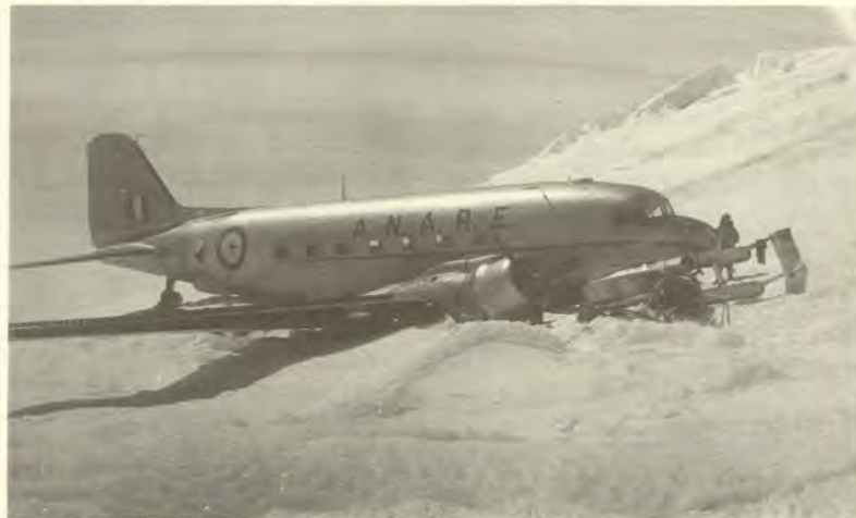
The demise of 'Ann Cherie'. A65-81 in crevasses on the ice cliff near Mawson.

All that remained was for Flight members to prepare salvaged stores for return to Australia, and assist with the clearance of the station site. The thawing of the ice and snow revealed timber, drums and other debris. As part of the preparation for changeover operations, a floating jetty was constructed from empty 44 gallon drums. A close watch was kept on the movements of the relief ships Magga Dan and Thala Dan . The latter berthed, amid cheers of welcome, on 27 January 1961. Magga Dan joined her sister ship before sailing for Australia on 11 February; it had been the first time that both ships had been in Horse Shoe Bay at the same time.