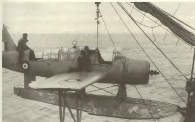
The Kingfisher is swung out for its only flight over Antarctic waters, 22 February 1948.

The implementation of these principles involved the resources of No.1 Stores Depot, Tottenham, Victoria. On 6 September 1948, the Chief Finance Officer, Department of Air, wrote to the Area Finance Officers in Melbourne, Sydney and Brisbane refining the procedures to be followed. In his letter he noted that all requisitions would be charged to the Antarctic Vote, and that all goods would be delivered to the ANARE store and claims rendered to the Secretary, ANARE, who would certify the claims and forward them to the Area Finance Office for payment of the contractor. (34)