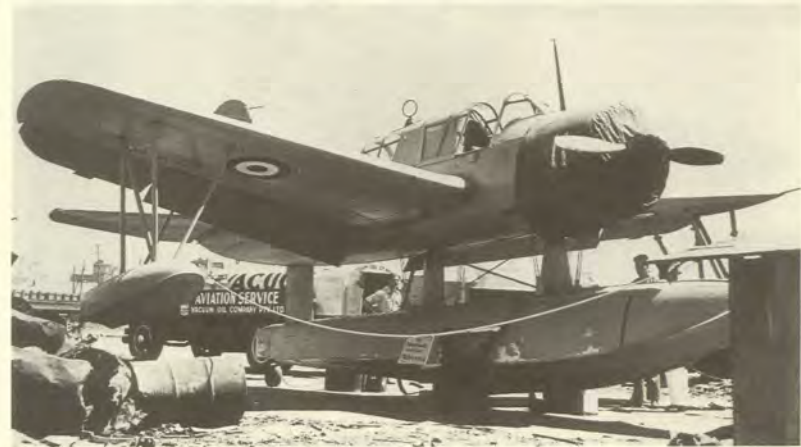
A48-13 photographed at Adelaide during 1947. It is possible that trials were undertaken to check the feasibility of carrying the aircraft aboard Wyatt Earp which was based at Port Adelaide at this time.