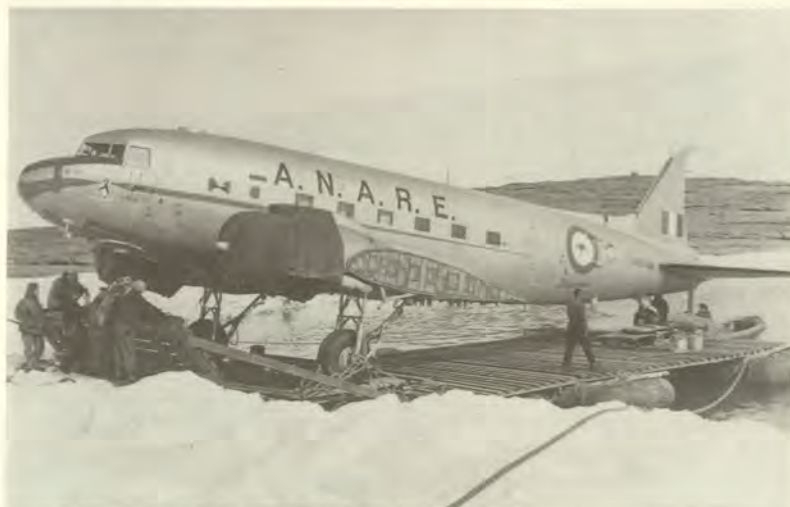
... and being unloaded at Mawson. (Graham Dyke)

During the unloading of general cargo next day, a mishap occurred which may have been disastrous for the Flight. The crane lifting the port mainplane gave way, allowing the wing to drop some distance onto the ice. Fears were held for the wing's structural integrity.