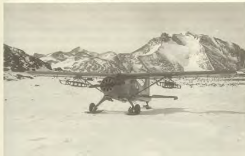
The Beaver fitted with Nansen sleds.