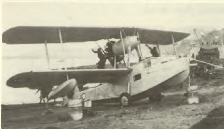
HD 874 tethered at Heard Island. LST 3501 is unloading in the background.