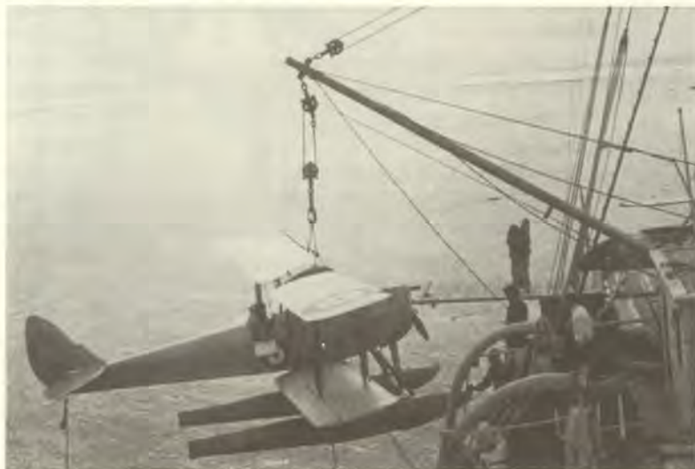
The Gipsy Moth is lowered from Discovery II prior to contacting the Lincoln Ellsworth expedition, 15 January 1936.

To enable the aircraft to be stowed on the ship, structural modifications had to be approved by the Discovery Committee in London. The transom post was removed to allow the Wapiti to be stowed, (23) with the Moth being housed on the flat roof of the ship's hospital. The modifications to the vessel delayed the departure from Melbourne until 24 December.