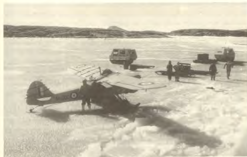
A11-200 on the ice during the approach to the Mawson Base, February 1955. (ANARE neg. No.3221)

The second flight was aborted due to a snow storm, and the aircraft hoisted back on board. Law was able to brief the captain on the leads which had been sighted during the initial reconnaissance. The following morning the Kista Dan commenced the tedious push through the pack ice, which extended some 20 miles from the site selected at Horse Shoe Bay as the site for the Mawson station. The ice was some 30 inches thick, so it was obvious that skis would be necessary for continued aircraft operations. The Antarctic Flight members pooled their resources to fit A11-201 with this equipment, the aircraft being serviceable by midday.