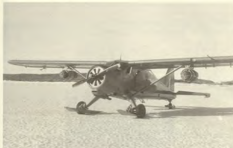
The Beaver, fitted with 25 gallon drums of diesel fuel on light series bomb carriers, is prepared to undertake a delivery.

the Russian rescue flight from departing from Mawson until the day after. The crew, all from the Polar Aviation Group, and the Australians exchanged pleasantries during the wait. The Auster was discovered on the 14th, with its undercarriage broken. The crew, who abandoned the aircraft with very little food, and only sleeping bags available for warmth, were extremely lucky that the Russian aircraft found them. The news of the rescue arrived at Mawson on the 16th, with the IL2 staging back through the station two days later.