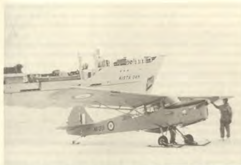
A11-201, fitted with skis, is prepared to support the Mawson Base approach party, February 1955.

Behind this laconic remark was drama, as two attempts had to be made to sight the flag markers which Leckie had previously laid. The landing was made on blue, pebbly, highly-polished ice, the skis creating no friction on the glassy surface. Law waited for the impact on the wall of an iceberg which was looming frighteningly close in the Auster's path. Leckie ground looped the aircraft, spinning it around and around, the extra friction on the edge of the skis bringing the aircraft to rest, a bare 30 yards from the face of the iceberg. Leckie calmly continued with the task of further