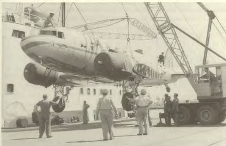
The Dakota being loaded at Melbourne. (Graham Dyke)