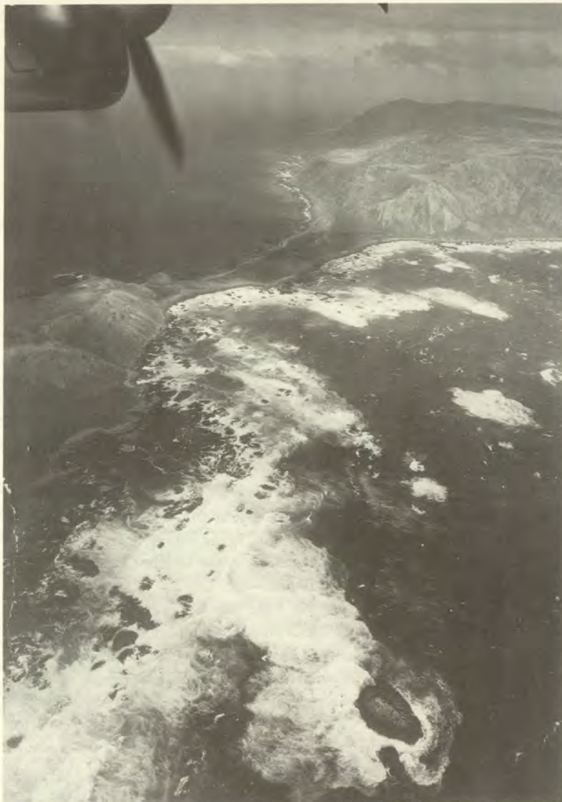
Hasselborough Bay, Macquarie Island, photographed from Lincoln A73-2 on 15 March 1947. The scientific station was later established on the isthmus.

detailed summaries of all information they had on the likely weather conditions, and it was decided that the flight would best be made in the summer months. When it came to the actual selection of the aircraft, we decided upon a Lincoln . . . with this flight we were not only able to make a complete pictorial survey of Macquarie Island but also find out how an Australian erected standard type of aircraft would behave in southern latitudes . . . the results achieved were in all ways completely satisfactory . . .'