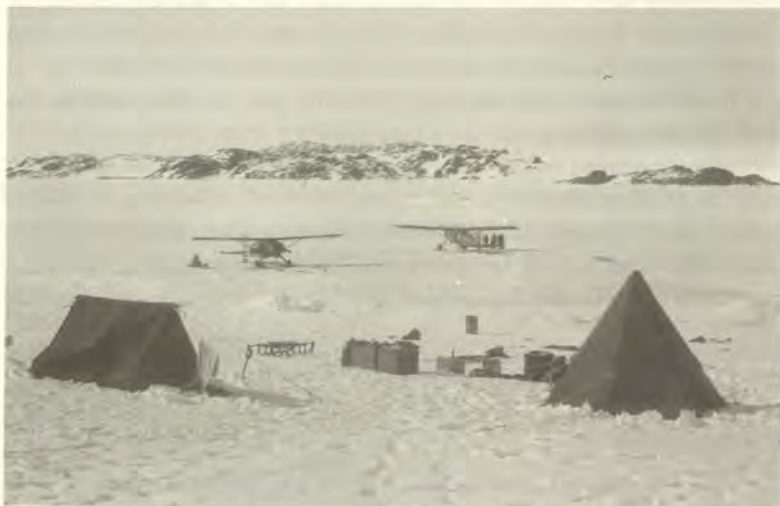
Camp site at Amundsen Bay, 400 miles west of Mawson.

Leckie Ranges and Prince Charles Mountains. A buffet lunch was provided for the visitors, and the hazards of polar flying forgotten for a period. Operations had been undertaken under extreme weather conditions with white outs, erratic winds, unreliable maps of the featureless terrain, and the difficulty in judging height on landing approaches providing a constant challenge. For example, Wilson attempted to land on light sastrugi 40 miles from Gillock Island, and found that the aircraft's skis were breaking through the ice. With great alacrity, he pushed some 6 ½ inches of boost into the engine, only just disengaging from the ice and becoming airborne.