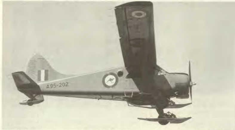
A95-202 shows her ski undercarriage and photographic equipment.