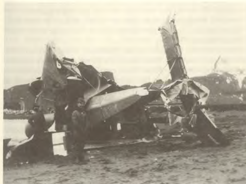
Heard Island, 22 December 1948. 'The Walrus was on the beach looking like no Walrus should look.'

The flight lasted an hour and a half, and was recalled due to unsatisfactory radio communications and the lowering of the cloud ceiling to some 500 feet at the ship. A fog, rolling in from the north would lower the visibility even further. The Walrus was taxied onto the beach at Atlas Cove, where she was tied down to concrete blocks. For Smith and the crew it had been a satisfactory flight: as a result, Atlas Cove was decided upon as the landing and camp site, they had exposed the first aerial photographs of Big Ben, the mountain which dominated the island, and must have been anticipating further flights and successes.