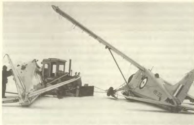
Result of the summer cyclone of December. The Beavers were definitely not airworthy.

break loose. Men snatched what sleep they could clad in their windproof clothing and cramponed feet before the weather improved and it was possible to drive the weazel back to Mawson.