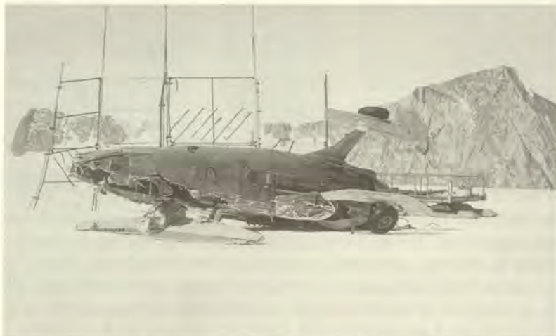
Wreckage at Rumdoodle — the remains of the Beaver in front of the intact wind fence. (Graham Dyke)

The men spent a sleepless night, the terror outside a reality which could not be ignored. By 1am on the 10th, the wind had eased, and snow commenced to fall. Five hours later, the camp was sheathed; the drift had cut the power supply. The drift was cleared, and contact made with the outside world at 10.15am. The camp had been under blizzard conditions for 42 hours.