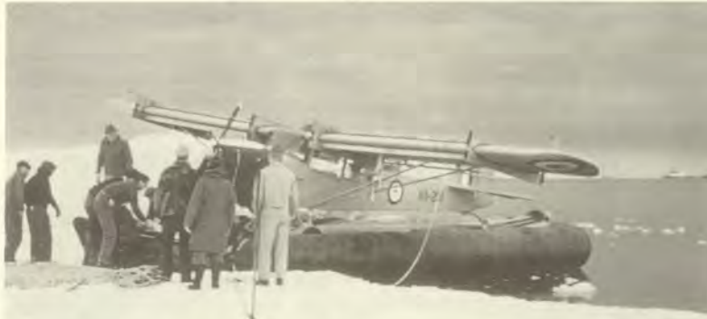
A11-201, the Antarctic veteran, is brought ashore at the American base at Wilkes, 24 January 1959.

managed to get the aircraft safely ashore. Leckie then flew it up to a better strip on the plateau behind the station, after first fitting skis. From the airstrip behind the station he was able to taxi down to peg it out near the radio aerials. With the aircraft on skis ashore a lot of flying immediately became possible. (84)