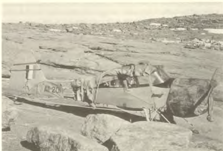
The fuselage of Auster A11-201 waiting shipment back to Australia. Components of this aircraft were used to rebuild A11-200 after the two Austers had been damaged aboard Kista Dan on 12 February 1955. A11-201 returned to the Antarctic in 1959.

With these difficulties, it was impossible to fly more than two sorties a day. Flying was intensely uncomfortable. Temperatures of 38 degrees Fahrenheit below zero at 8,000 feet caused Seaver to suffer from cramps. On one flight the engine failed, due to water freezing in the fuel lines. Leckie recorded: