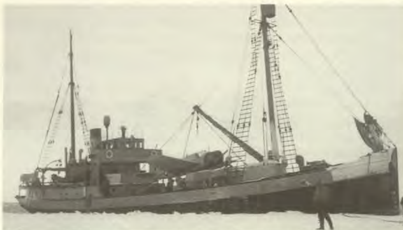
Wyatt Earp at the Continental ice edge, February 1948. Note the overhang of the Kingfisher's wings. (ANARE neg. No. 4883).

of sheep and goats for the sub-Antarctic environment, would be undertaken.