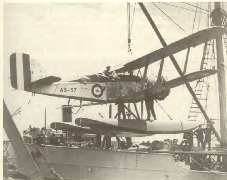
The Wapiti A5-37 is hoisted aboard Discovery II prior to that ship's dash south to locate Lincoln Ellsworth.

vessel Discovery II was placed at Australia's disposal. Although almost due south of Fremantle when the request for assistance was received (20) it was a fortnight before the ship berthed at Melbourne.