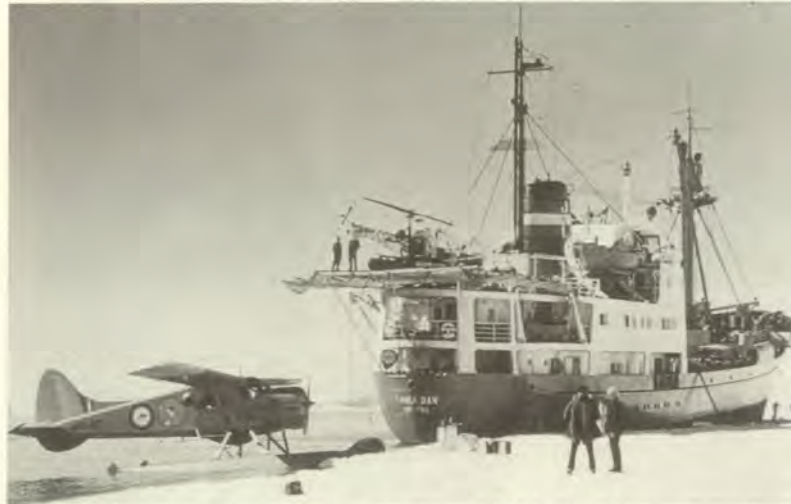
The period of transition. The Beaver shelters under the stern of Thala Dan. Note the civilian aircraft Bell 47G on the stern of the ship.

the 11th, Thala Dan set course for Davis, where it arrived on the 21st. In the interim, the Beaver had flown a photographic sortie from Thala Island to Williamson Head. After the ship anchored at Davis, the aircraft flew inland heighting runs at a distance of 50 miles from Williamson Head. The final flight from Davis was one of four hours, from Thala Island to Renwick Bay.