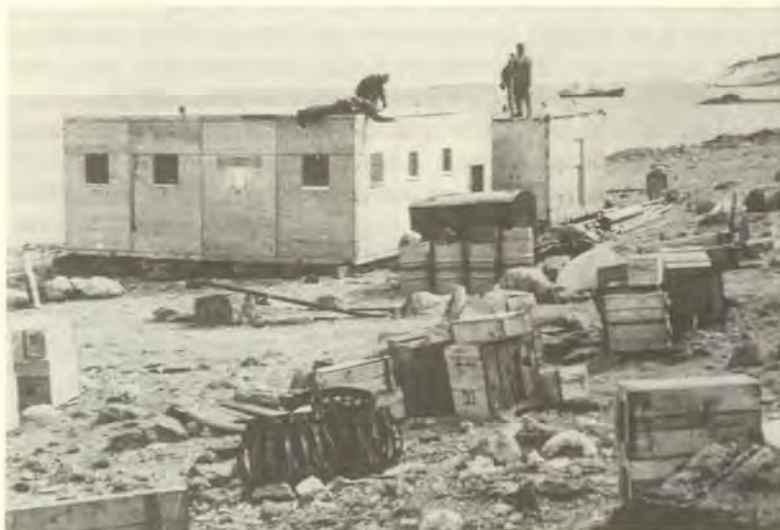
Construction of the base at Davis.

The aircraft returned to Mawson via Mount Caroline Mikhelson, at the southern edge of Prydz Bay, on 19 May. This track was selected to establish, with certainty, whether the mountain was volcanic or not.