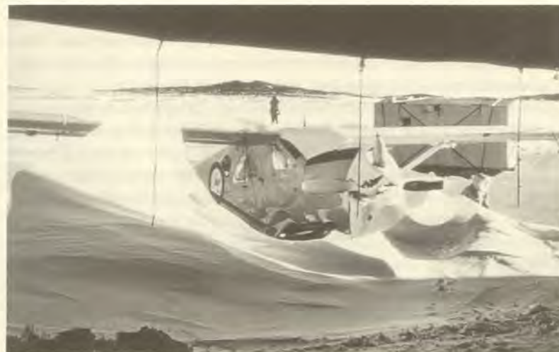
Joys of Antarctic flying. A Beaver is covered by drift snow at Mawson.

Casey Bay due to a combination of slippery ice and wind. On the 21st, the idling system in A95-203 was found to be affected by the ice and was remedied before both aircraft took off. One aircraft suffered a complete radio failure, and returned to Mawson.