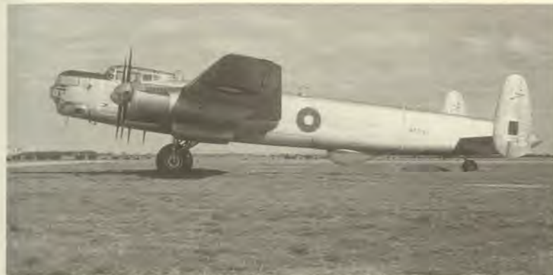
Lincoln A73-2 which made the flight to Macquarie Island on 15 March 1947 and later during 1951.

Both these Liberator flights were undertaken to gain weather data for use on the next scheduled flight, which was intended to determine the suitability of a Lincoln aircraft for flight in southern latitudes, to collect meteorological data and to photograph Macquarie Island. The aircraft selected was A73-2, which was on issue to No.1 Air Performance Unit, based at Point Cook, Victoria. It had been modified for the task by the fitting of a second astrodome in lieu of the mid upper gun turret, a Lancastrian tail cone, radio compass, radio altimeter and two 400 gallon fuel tanks in the bomb bay. The flight to Macquarie Island on 15 March