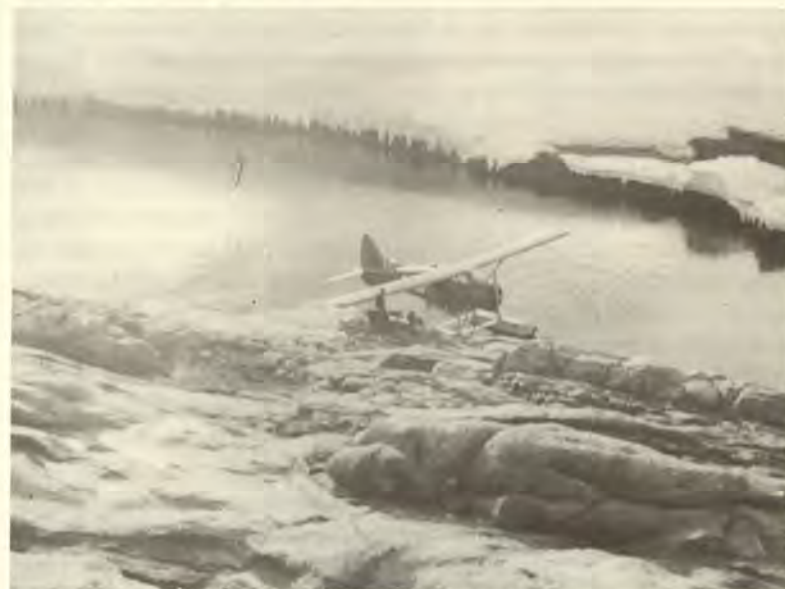
The Beaver shelters near Ivanoff Head after force landing.

passage to the island, and also curtailed an approach to Porpoise Island. The ship returned to Wilkes.