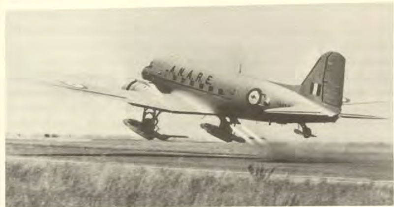
A65-81 undergoing JATO trials at ARDU. Note the skis and the camera mounts to the rear of the fuselage.