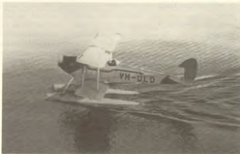
The first Australian aircraft to serve over the Antarctic Continent, Gipsy Moth VH-ULD, during the BANZARE 1929-1931.

Antarctic exploration. Among the equipment was 'a light aeroplane for traversing pack-ice and for increasing the range of observation'. (2) He would have preferred two aircraft, but space aboard the Royal Research Ship Discovery precluded carrying more than one. The aircraft selected was a two seat De Havilland DH60G Moth, registered VH-ULD, which was to be the first Australian aircraft to see service over the Antarctic.