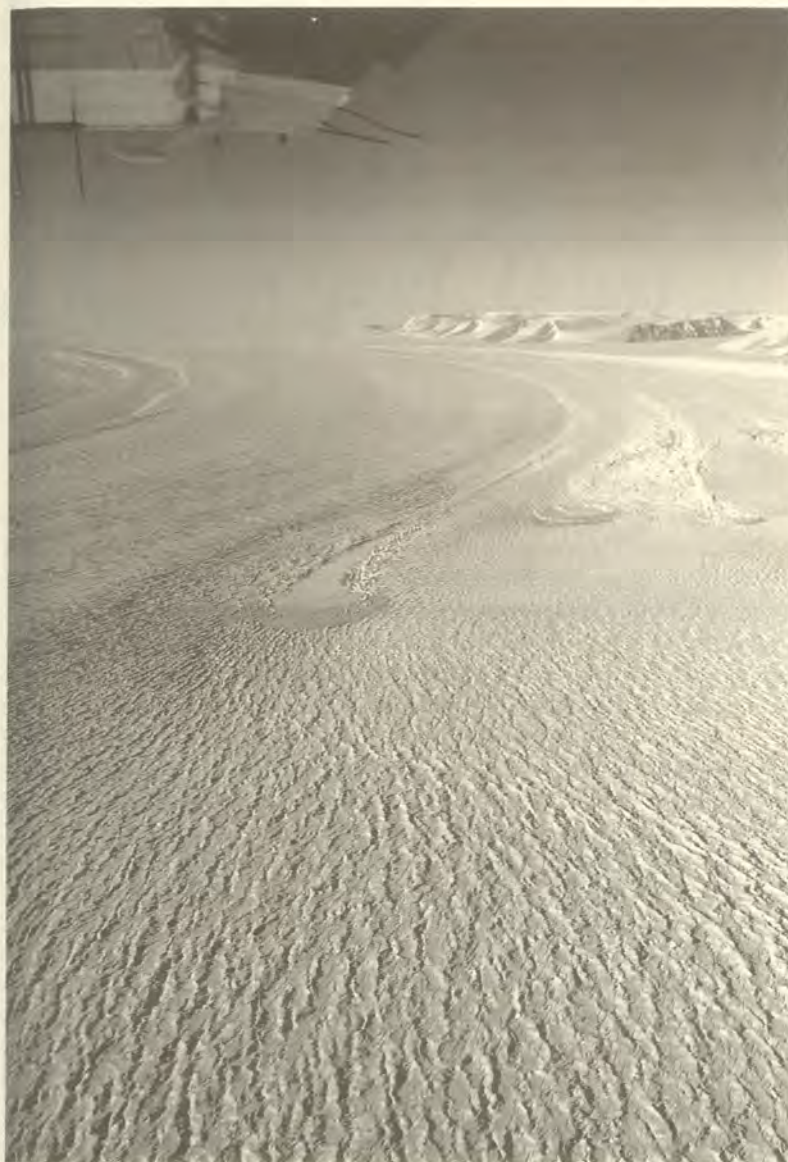
Lambert Glacier, one of the largest in the world, over which Seaton flew on 28 November 1955.

At this stage, through fuel considerations, I was forced to set course for Aerial Depot again. On the return flight, as I was not taking trimetrogon photographs, I was able to alter course at will to study some of the western mountains and the nature of their terrain. They retained a similar appearance to those on the eastern side but were in individual positions; sheer sided and with the same cobble stone tops, they presented a spectacular sight. Three distinct tributaries of ice ran into the main glacier, their confluence causing high pressure ridges at their junctions and, in other areas, crevasses of considerable length which would form an impenetrable barrier to any form of land transport. The whole of this western area was the same, with the crevassing continuing well north into the Prince Charles Mountains.