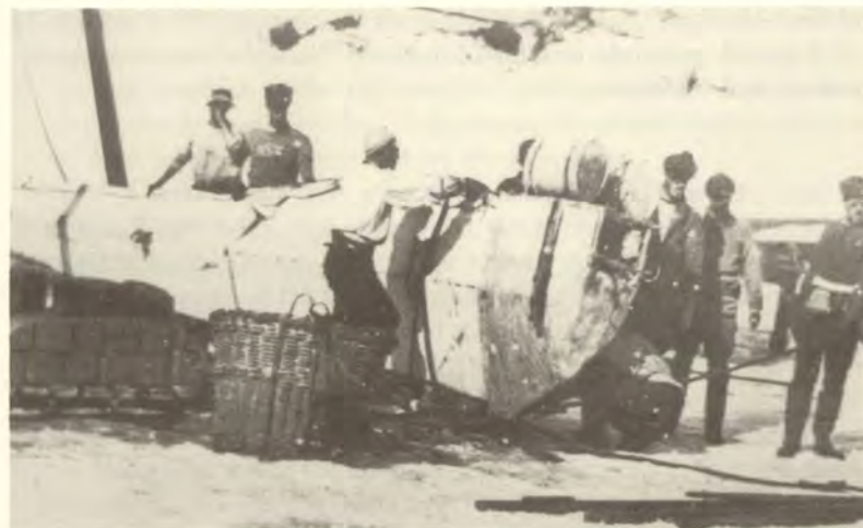
The R.E.P. Monoplane, minus wings, was used as an 'air sled' by the Mawson Expedition of 1911.

A USTRALIA and her inhabitants have long historical links with the Antarctic continent and the sub-Antarctic islands, dating back to the days of Captain James Cook. The first grounding on the Antarctic continent was made by a Norwegian resident of Melbourne, H.J. Bull, who landed a party of men from the whaling ship Antarctic during January 1895 at Cape Adare. A member of his crew, C.E. Borchgrevink, led the